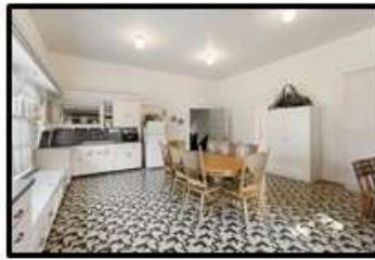
Upstairs 1940's Kitchen