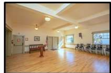
Main Meeting Room

PHONE: 360-753-9921 WEBSITE: THEABIGAILSTUARHOUSE.COM